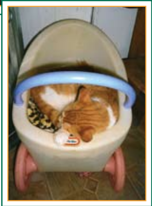
Marley, 15 months, enjoys an afternoon nap in "the park" aka Adoption Room.