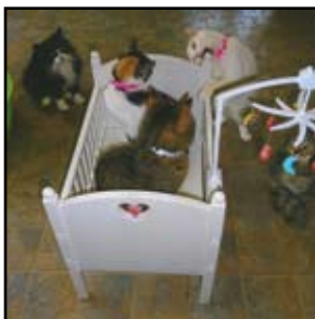
Bitty Baby crib is always a popular spot to be.